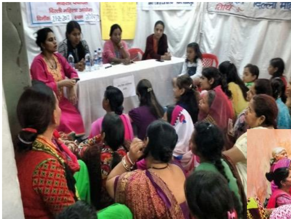
Women in Mahila Panchayat meetings