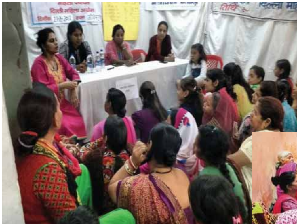
Women in Mahila Panchayat meetings