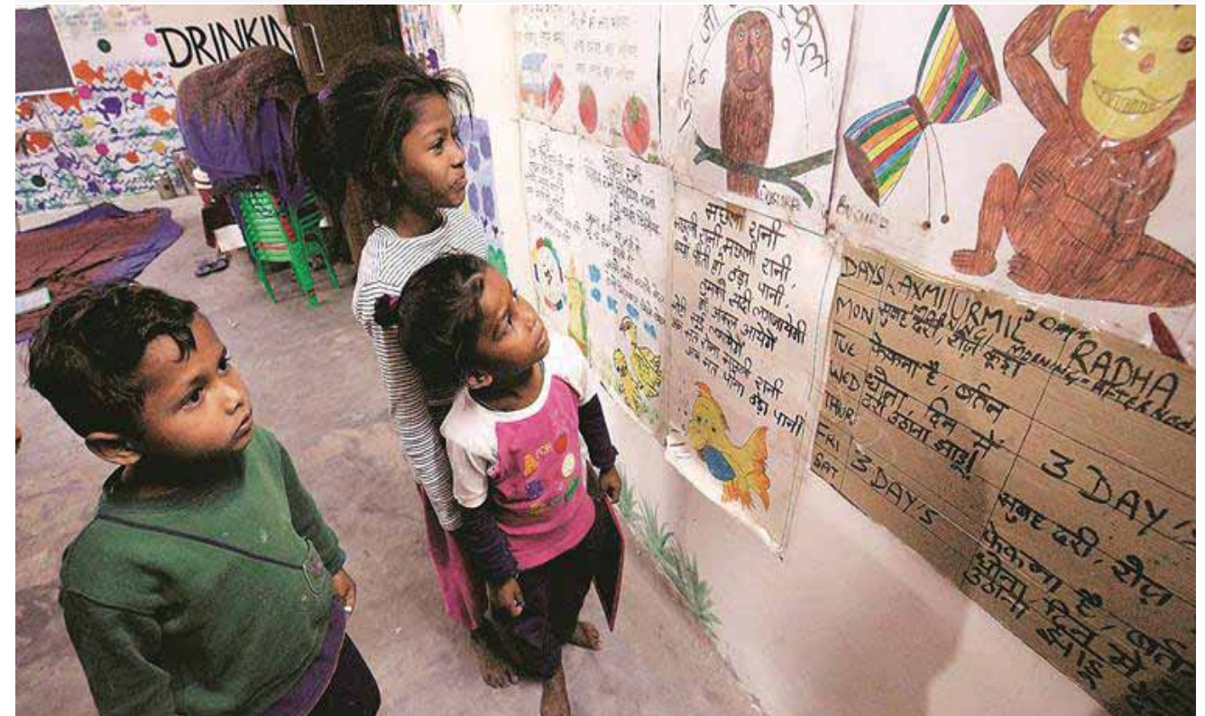
Anganwadi centre in Taimoor Nagar

10,98,790 children are accessing services of nutrition, vaccination, health services and pre-school activities at 10,897 Anganwadi centres under ICDS