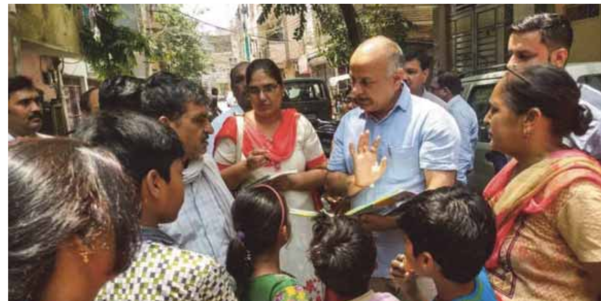
Hon. Dy CM during an Anganwadi Inspection

Innovative reform measures to transform Delhi's Anganwadis